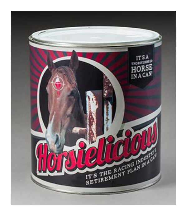
Can of 'Horsielicious: the racing industry's retirement plan in a can', 2014. Donated by the Coalition for the Protection of Racehorses. National Museum of Australia.