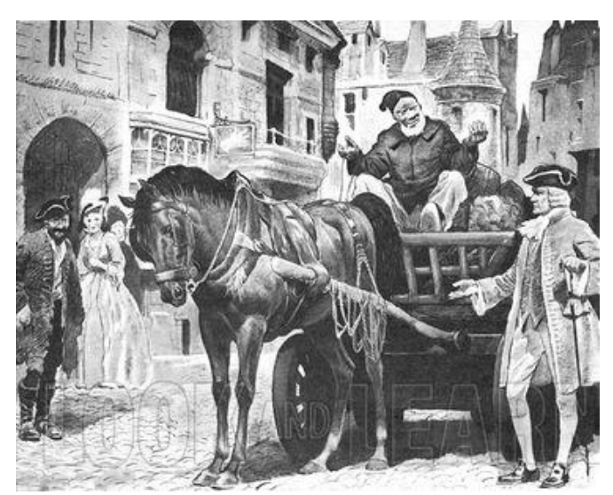
Fig. 2 A host of legends surrounded the career of Godolphin Arabian (1724). Among the more farfetched was that he was discovered in Paris drawing a water cart. This story is attractive but difficult to substantiate (Willett 1970, Longrigg 1972).

And exactly 150 years ago, the empathy for the forgotten and worn-out racehorse was also a subject in the fictitious story "The life of a racehorse" of Mills (1865), where the horse Sheet Anchor (remarkably said to be out of a dam-line by Godolphin Arabian) ended as the property of an adventurous cabman – alone, dwelling on the past, without a friend and a hope (Fig. 1).