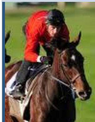
Profound Beauty (Danehill) owned and bred by Moyglare Stud.