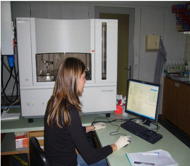
Fig. 2: Automated DNA Sequencer