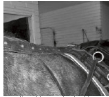
An adjustable overcheck with stopper mechanism.

Bits of the type often referred to as Crit Davis bits are allowed. They shall have rounded profiles. When fitted with a plate, this should be smooth, homogeneous and have a maximum length of 35 millimetres.