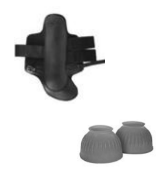
Hind boot and bell boots.

All kind of protective gear shall be clean and properly adjusted. Elastic bandages shall have a wrap underneath and shall not block the circulation of the leg. Too loose bandaging may compromise the protective function as well as security.