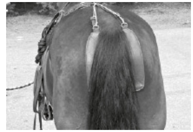
Rubber flap (faeces shield).