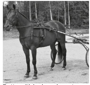
Trotter with basic equipment.

Xylofonia halters shall be used with a safety strap or chain between the rein and the ring of the driving bit. Exception is made for halters having two layers of leather united by a seam or have been reinforced by a layer of strong added material. The security chain should be fixed by a buckle or a permanent ring. Neither