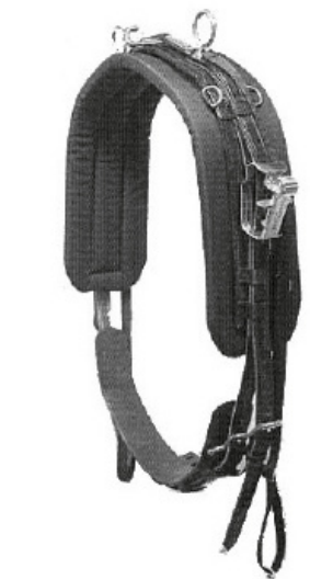
Harness with Quick Hitch.

All parts of the harness shall be clean and kept in good condition. The harness shall also be adjusted correctly. It should always be fitted with a security strap – or if Quick Hitch is not used – with an upper and a lower hitching strap combined. When racing, a horse shall always wear a breast collar and crupper. The reins shall run through the harness rings and be fixed directly to the bit via buckles with reinforcement of leather, metal or synthetic material. Snap hooks or similar are not allowed. The reins should be complete. In sulky races, handholds shall always be used.