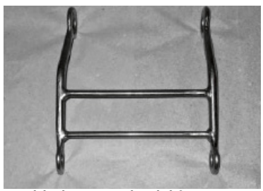
Double-bar overcheck bit.