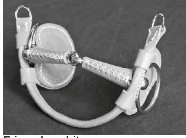
Frisco June bit.