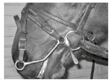
Horse with a double-bar overcheck bit.