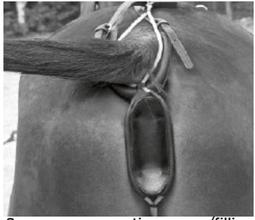
Suspensor preventing mares/fillies from sucking air into the vagina.