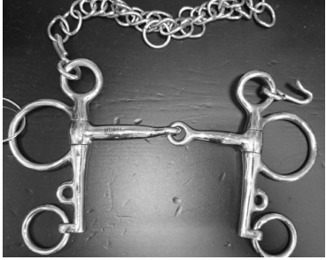
Pelham bit with curb chain.