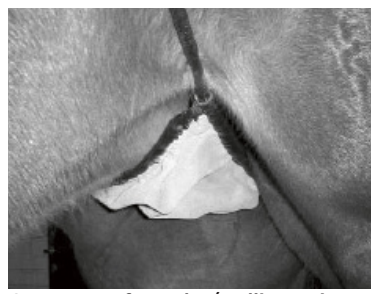
Suspensor for colts/stallions viewed from behind.