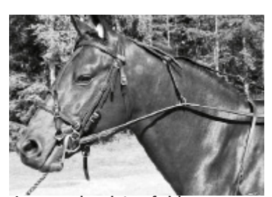
Approved variety of sideways overcheck.